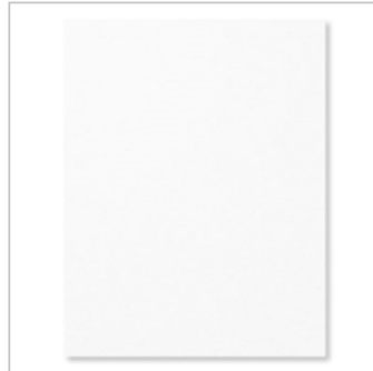
Whisper White 8-1/2" X 11" Cardstock