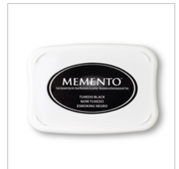
Tuxedo Black Memento Ink Pad