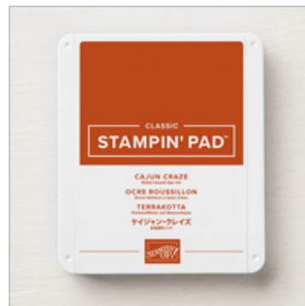
Cajun Craze Classic Stampin' Pad