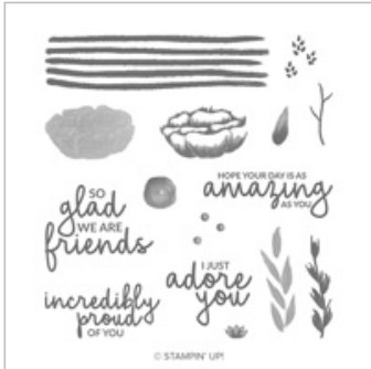
Incredible Like You Photopolymer Stamp Set