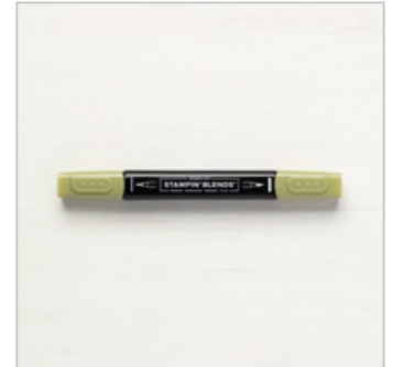
Mossy Meadow Light Stampin' Blends Marker