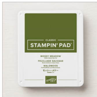
Mossy Meadow Classic Stampin' Pad