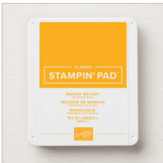
Mango Melody Classic Stampin' Pad