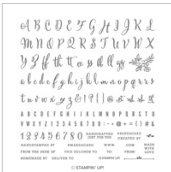
Make A Difference Photopolymer Stamp Set