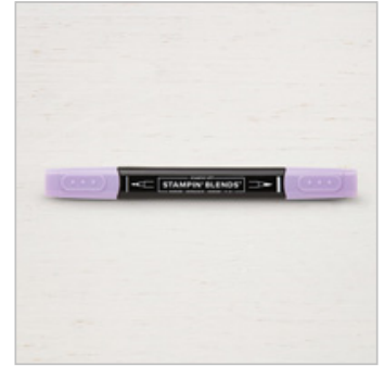
Light Highland Heather Stampin' Blends Marker