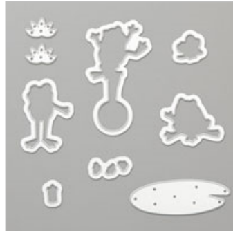
Hop Around Framelits Dies