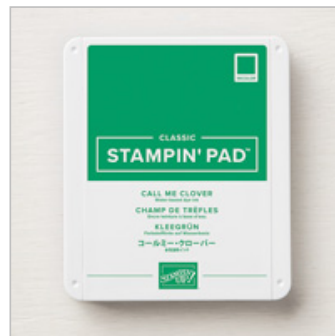
Call Me Clover Stampin' Pad