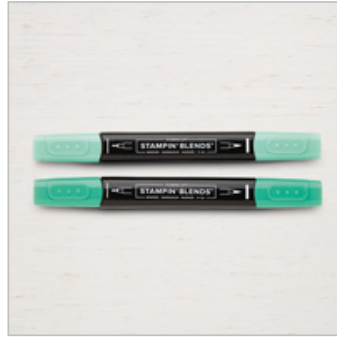
Call Me Clover Stampin' Blends Markers Combo Pack