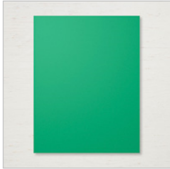
Call Me Clover 8-1/2" X 11" Cardstock