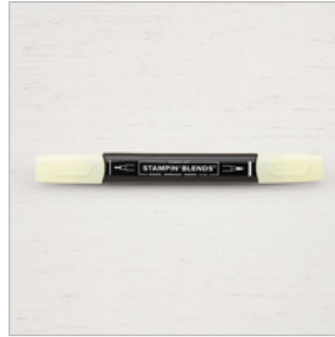
Light Pineapple Punch Stampin' Blends Marker