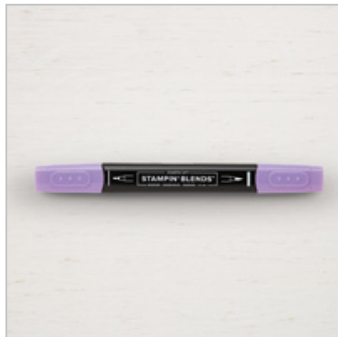
Dark Highland Heather Stampin' Blends Marker