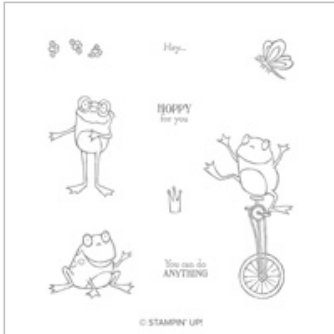
So Hoppy Together Cling Stamp Set