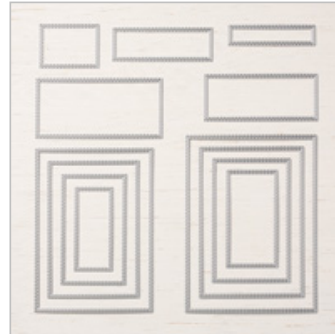
Rectangle Stitched Framelits Dies