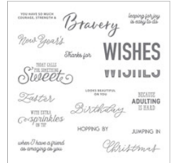
More Than Words Photopolymer Stamp Set