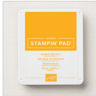
Mango Melody Classic Stampin' Pad