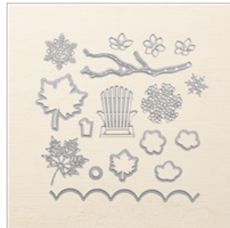
Seasonal Layers Dies