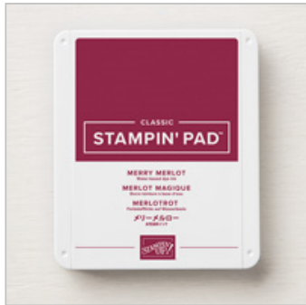
Merry Merlot Classic Stampin' Pad