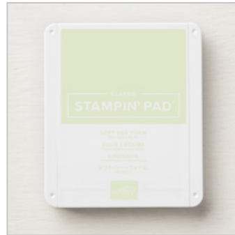
Soft Sea Foam Classic Stampin' Pad