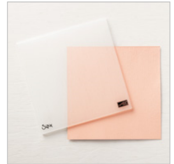
Subtle Dynamic Textured Impressions Embossing Folder