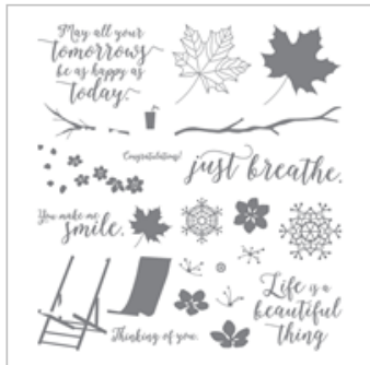
Colorful Seasons Photopolymer Stamp Set